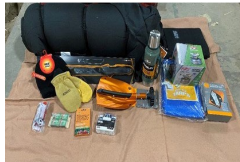
Figure 10: NEM “Go Bag”

NEM remains committed to enhancing the capabilities of Search and Rescue operations across Nunavut. In line with this commitment, NEM continues to provide support to Municipal Ground Search and Rescue teams by supplying “Go Bags”. These bags are equipped with an array of essential survival items, carefully selected to ensure the safety and well-being of responders in even the most challenging circumstances. From tarps and snow knives, to mittens, toques, sleeping bags and signal mirrors, each item is chosen to empower responders to face the unpredictable realities of the land with confidence and resilience. NEM ensures that GSAR teams are prepared and safe so they can focus on the search at hand when called to do so.