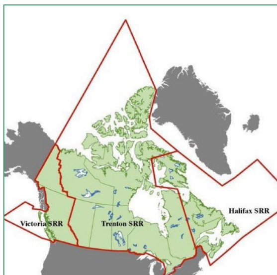
Figure 2: Search and Rescue Regions (SRR) of Canada

Search and rescue operations in Nunavut represent a critical lifeline for residents navigating the rugged terrain and extreme weather conditions of Canada's northernmost territory. Ground and in-land water search and rescue is the responsibility of the territorial government. In other jurisdictions it is covered under the Community Police Service Agreement. Nunavut presents unique challenges and demands a highly coordinated and adaptive approach to search and rescue efforts. This can include active engagement with other GN divisions and departments, territorial partners, federal partners, industry, and private enterprise. From assisting individuals stranded in harsh winter conditions to responding to emergencies in remote areas, search and rescue teams in Nunavut demonstrate dedication and courage in their mission to save lives. NEM coordinates with local search and rescue volunteer groups in the municipalities to ensure that guidance, training and support are available. On-the-land medivacs are the responsibility of the Department of Health. NEM's role is to assist in locating air and ground support as needed. This is covered under the Memorandum of Understanding Between the Department of Community and Government Services (CGS) and Department of Health.