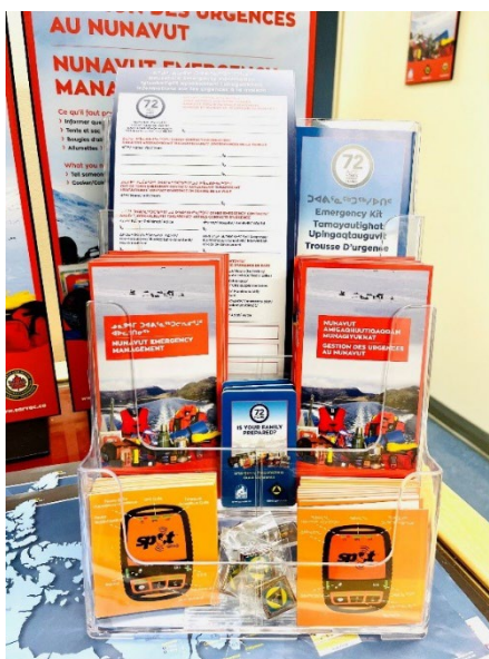
Figure 8: NEM Brochures