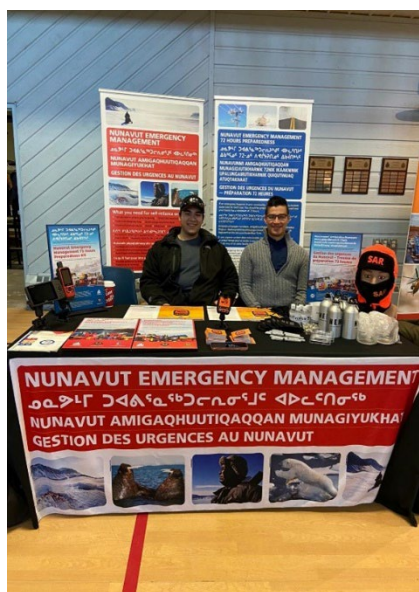
Figure 7: NEM Booth

NEM continues to distribute Winter and Summer self-reliance posters to all Nunavut communities. Continuing on from the 2022-2023 fiscal year, NEM developed new 72-hour preparedness refrigerator magnets, fliers, and Emergency Preparedness quick reference guides to support family awareness in Nunavut.