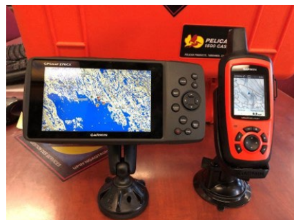
Figure 11: Garmin GPS 276cx and InReach Communication

Over the years, NEM has continued to enhance responder safety by providing all GSAR teams across Nunavut with the Garmin 276cx GPS units and InReach devices. These cutting-edge tools represent a significant advancement in navigation and communication capabilities for our responders. The Garmin 276cx GOS units are renowned for their user-friendly interface and durability, specifically tailored to excel in the challenging Arctic environment. Paired with the InReach device, which offers reliable two-way communication and emergency SOS functionality, these tools empower GSAR responders to navigate treacherous terrain with precision and maintain vital contact with command centers. By equipping GSAR teams with these technologies, NEM is not only enhancing the safety of responders but also bolstering the efficiency of search and rescue operations across Nunavut. With these resources at their disposal, GSAR teams are better equipped than ever to save lives and ensure the well-being of those in need across the territory.