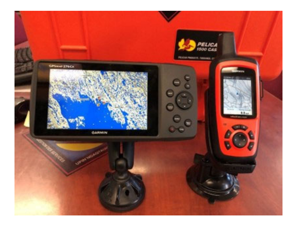
Figure 11: Garmin GPS 276cx and InReach Communication