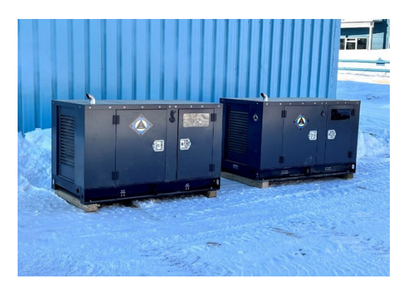
Figure 6: Picture of Generators Supplied by NEM