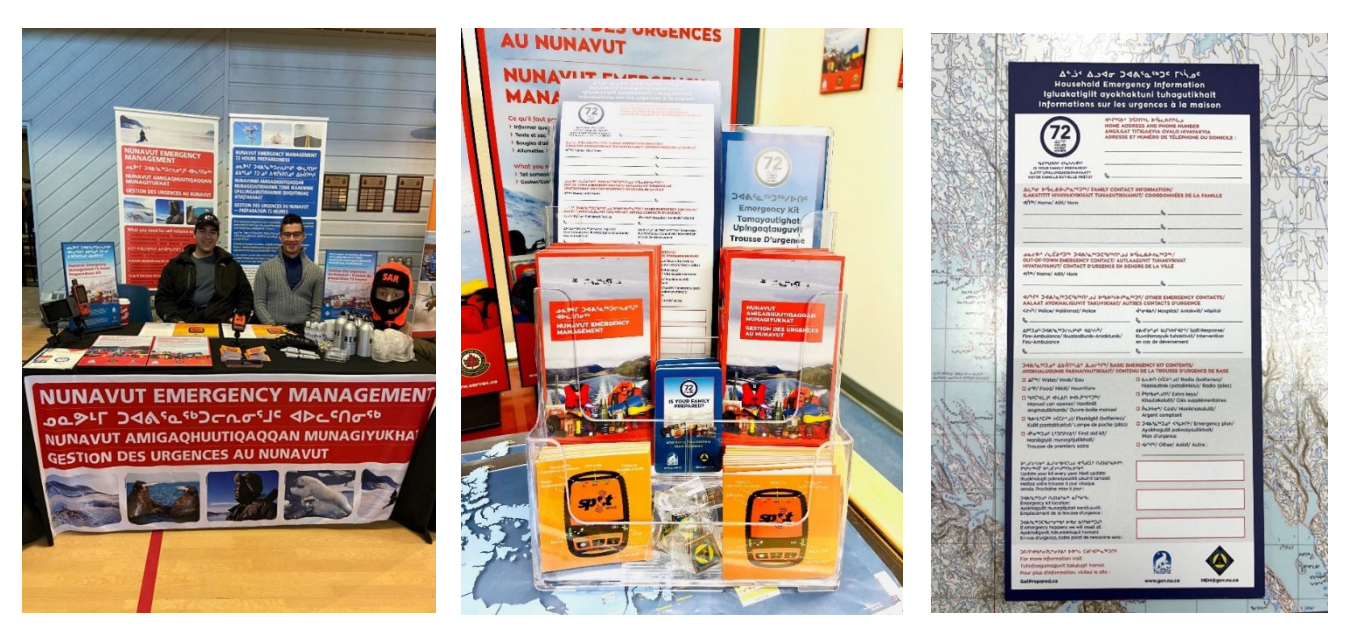
Figure 7: NEM Booth

NEM continues to distribute Winter and Summer self-reliance posters to all Nunavut communities. This fiscal year NEM developed new 72-hour preparedness refrigerator magnets, fliers, and Emergency Preparedness quick reference guides to support family awareness in Nunavut. NEM conducted a Territory wide mail-out of 72-hour Preparedness refrigerator magnets and fliers to promote household readiness in Nunavut.