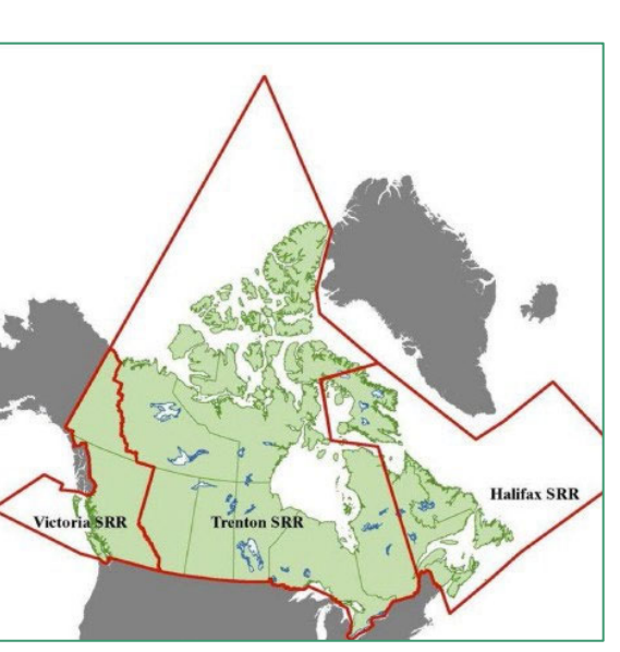
Figure 1: Search and Rescue Regions (SRR) of Canada:

Search and rescue operations in Nunavut represent a critical lifeline for residents navigating the rugged terrain and extreme weather conditions of Canada's northernmost territory. Ground and in-land water search and rescue are the responsibility of the territorial government. In other jurisdictions, it is covered under the Community Police Service Agreement. Nunavut presents unique challenges and demands a highly coordinated and adaptive approach to search and rescue efforts. From assisting individuals stranded in harsh winter conditions to responding to emergencies in remote areas, search and rescue teams in Nunavut demonstrate dedication and courage in their mission to save lives. NEM coordinates with local search and rescue volunteer groups in the municipalities to ensure that guidance, training and support are available. On-the-land medivacs are the responsibility of the Department of Health. NEM's role is to assist in locating air and ground support as needed. This is covered under the Memorandum of Understanding Between the Department of Community and Government Services (CGS) and Department of Health.