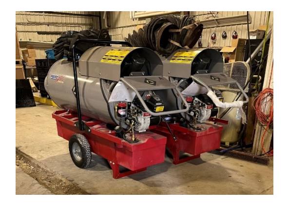
Figure 5: Picture of Heaters Supplied by NEM

The third request for assistance occurred in February 2023, prompted by a Local State of Emergency in Iqaluit, caused by areas of the utilidor freezing within its water distribution system. The city requested bottled water for residents affected by prolonged efforts to thaw and repair water lines. NEM provided bottled water and contributed two Herman Nelson heaters along with generators to assist with thawing the utilidor lines.