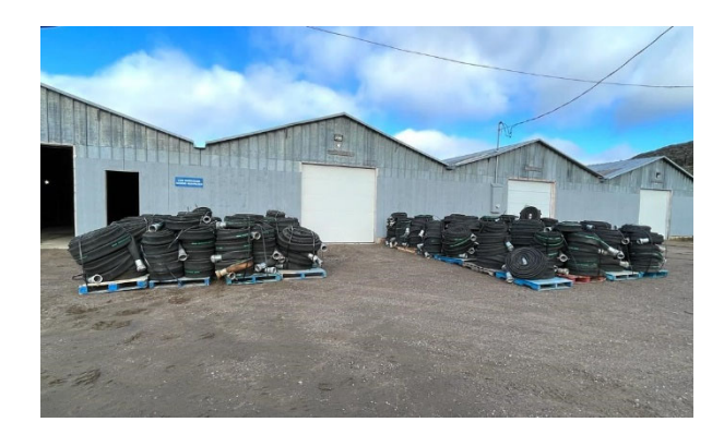
Figure 4: Picture of Supply Lines and Fittings installed on the land.

Figure 3: Picture of Supply Lines and Fittings.