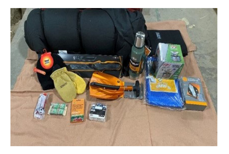
Figure 10: NEM "Go Bag"